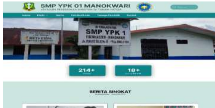
Figure 5. Homepage UI

Figure 5 displays the main page of the SMP YPK 01 Manokwari website, which includes features, navigation bars, and information related to the school system's workflow. The information presented includes the number of students and teachers, brief news, extracurricular activities, and information about educators. This allows for effective monitoring of the system's workflow structure.