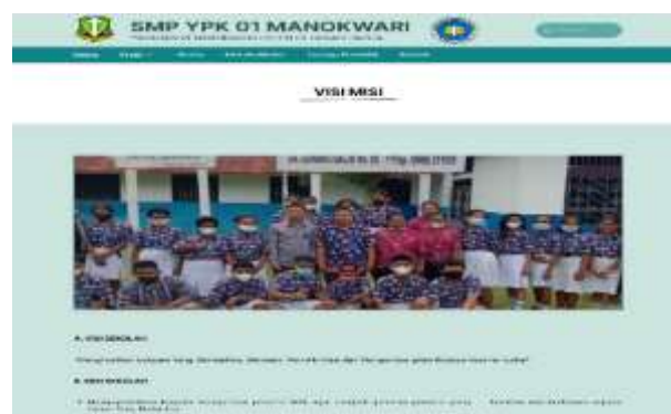
Figure 7. Vision Mission UI

Figure 6 displays a page from the SMP YPK 01 Manokwari website containing information about the school. It includes the school's history, teacher's code of ethics, Pancasila profile, and student regulations. This provides a comprehensive overview of the background, values, and rules that form the basis for activities at SMP YPK 01 Manokwari.