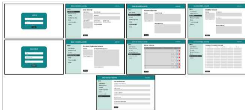
Figure 4. Admin Dashboard UI

Figure 4 displays all the admin dashboard design pages of the SMP YPK 01 Manokwari website. These pages showcase various features such as school data input, school information input, vision-mission input, organizational structure input, news input, educator input, and contact input. This indicates that the admin dashboard provides full access and control over the management of various information and content related to the school.