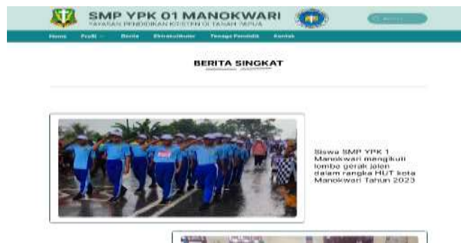
Figure 9. News UI

Figure 8 displays a page from the SMP YPK 01 Manokwari website providing an overview of the school's organizational structure. The structure includes positions ranging from the principal and vice-principal to the school board/committee, administrative department, library, laboratories, and other departments. This provides a clear understanding of the arrangement and parts involved in managing SMP YPK 01 Manokwari school.