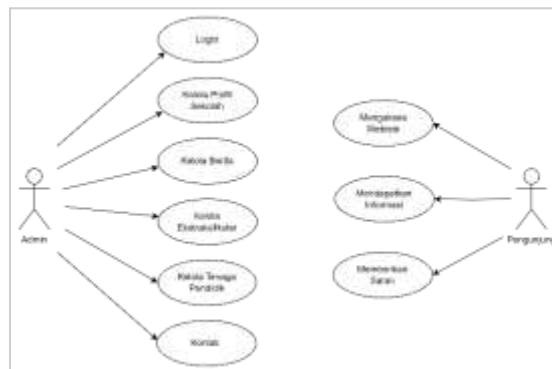
Figure 2. Use Case Diagram

Figure 1 illustrates the stages of the research process. It commences with a review of relevant literature from applicable journals concerning the adopted methodology. Following this, identification of study-related issues is conducted, succeeded by the process of problem resolution to identify suitable solutions. Subsequent stages involve the creation of interface design and the implementation of user interface and user experience testing to assess whether the interface adequately meets the established criteria. The central focus of this research is on UI/UX design utilizing the SUS method, coupled with tailored design considerations to address user requirements.