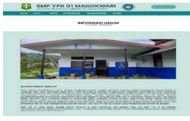
Figure 6. General Information UI

Figure 5 displays the main page of the SMP YPK 01 Manokwari website, which includes features, navigation bars, and information related to the school system's workflow. The information presented includes the number of students and teachers, brief news, extracurricular activities, and information about educators. This allows for effective monitoring of the system's workflow structure.