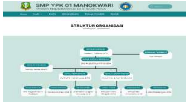
Figure 8. Organizational Structure UI

Figure 8 displays a page from the SMP YPK 01 Manokwari website providing an overview of the school's organizational structure. The structure includes positions ranging from the principal and vice-principal to the school board/committee, administrative department, library, laboratories, and other departments. This provides a clear understanding of the arrangement and parts involved in managing SMP YPK 01 Manokwari school.