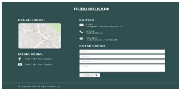
Figure 11. Contact UI

Figure 11 displays a page from the SMP YPK 01 Manokwari website containing information about the school's location, contact details, and social media links. Additionally, there is a feedback box that allows website visitors to provide feedback or suggestions. This provides convenience for website users to know the school's location, contact the school, and interact through social media. Furthermore, the feedback box serves as a means for website visitors to actively participate in providing feedback to the school.